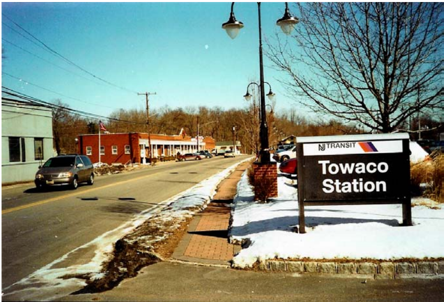
Existing View facing North along Route 202