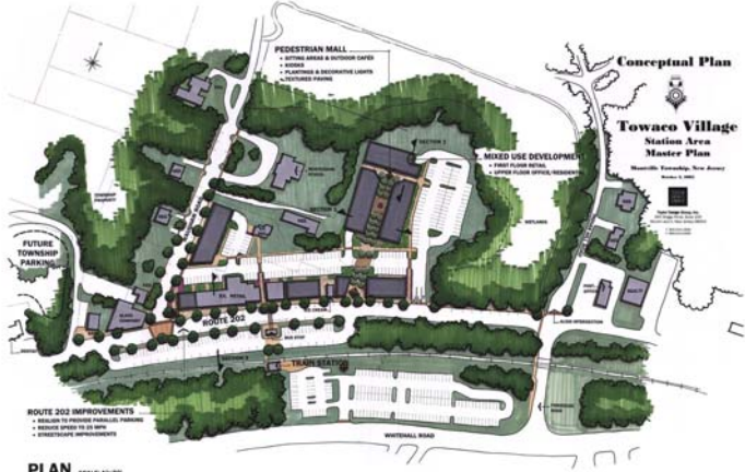
PLAN SCALE 1"=100' Concept Plan Graphics