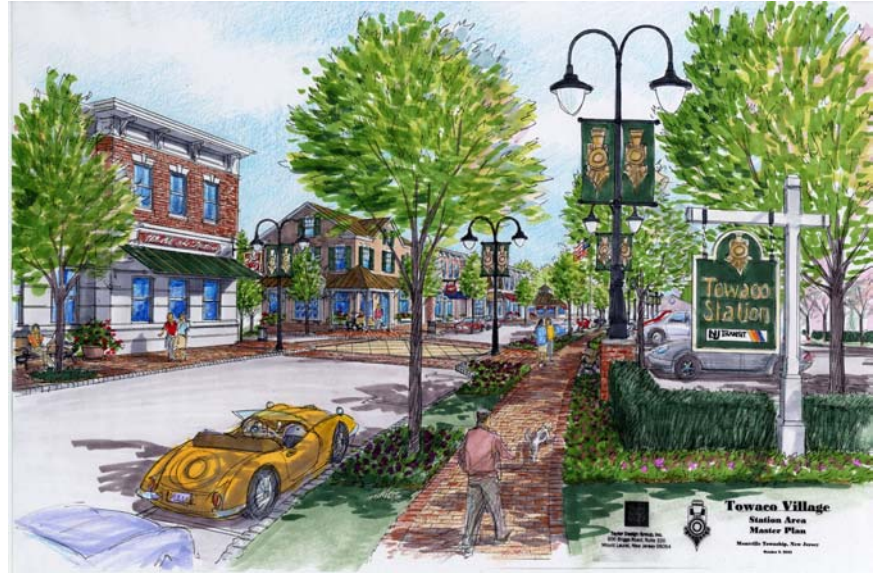
Proposed Towaco Village Vision facing North along Route 202

The Towaco Village Station Area Master Plan and Development Ordinances will guide rehabilitation and new construction within the Study Area, as part of the land development approval process.