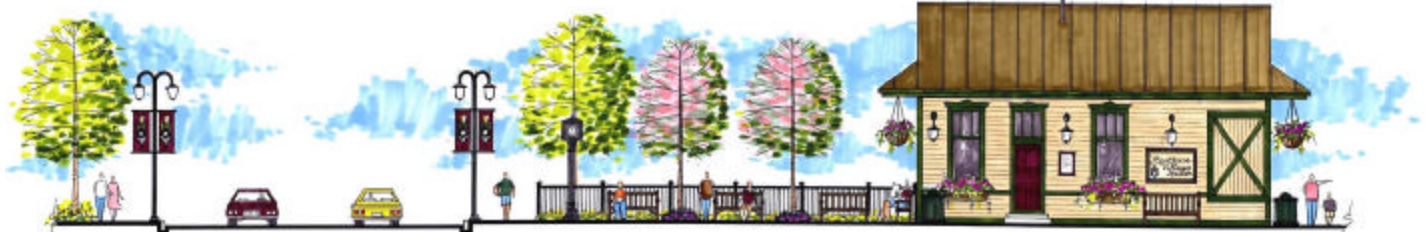
Master Plan Vision- Diamond Bridge Avenue Elevation