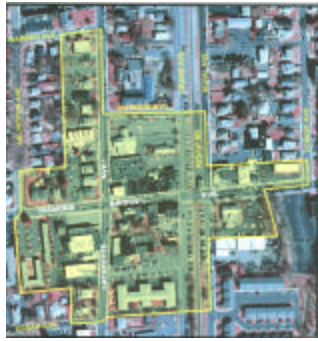
Project Area Map