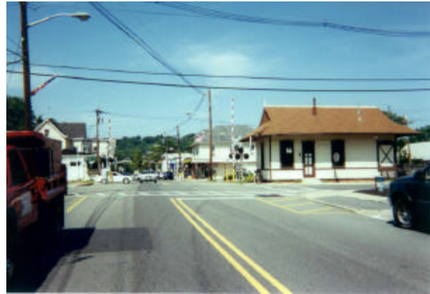
Existing Streetscape- Diamond Bridge Ave.

The Station Area Master Plan establishes a vision for the creation of potential ordinance modifications to guide rehabilitation and new construction within the Village, as part of the land development approval process.